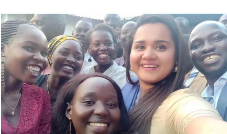
THE OFFICE OF THE SECRETARY-GENERAL'S ENVOY ON YOUTH AND THE UNITED NATIONS SYSTEM STAFF COLLEGE